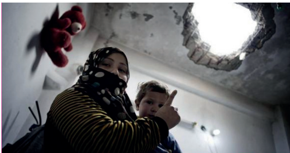
A woman and her son shelled, Homs

Syria is a major influence in the Middle East. Any destabilisation there could cause knock-on effects in countries such as Lebanon and Israel, where factions inside Syria can mobilise powerful proxy groups, including Hezbollah and Hamas. Lebanon, for instance, is largely split between groups that support the Al-Assad regime; and reports such as of the stop and search of refugees entering Lebanon through the Beka'a valley (an area that is predominantly Shia and under Hezbollah control) only creates additional tension since the refugees are predominately Sunni 24 . The recent outbreaks of violence in northern Lebanon have already sparked fears that the unrest in Syria has the potential to incite sectarian war in the region and mirror the violent tensions of its neighbour. 25 Syria also has close ties with Iran – a rival of the US, Israel and Saudi Arabia – which could potentially draw these powers into a full scale Middle Eastern conflict, if not carefully negotiated. 26