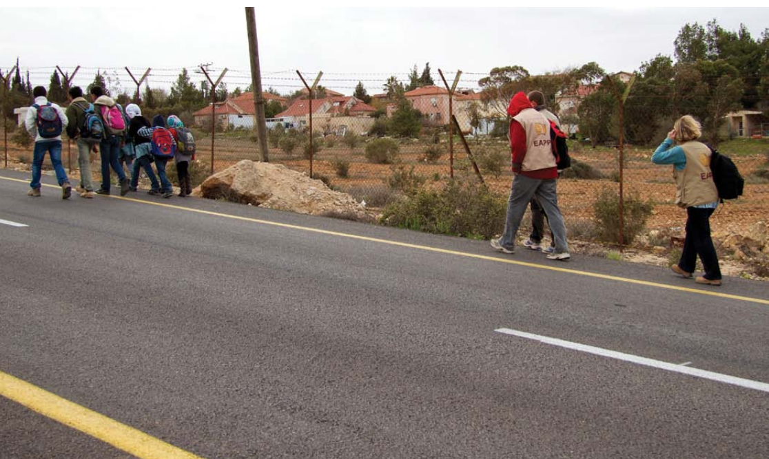
EAs walk with a group of students from the Seam Zone along the edge of a bypass road past an Israeli Settlement to their school on the West Bank side of the barrier.

There is a frequent presence of armed soldiers and military vehicles in and around the school. Soldiers enter the school at least on a monthly basis and they often stand by the school and check the children's book-bags. "The younger children cry, the older ones ask why the soldiers are here. Yet, all the students come to school with a lot of stress. They are unable to concentrate and this results in poor grades," said Adnan, the school's principal.