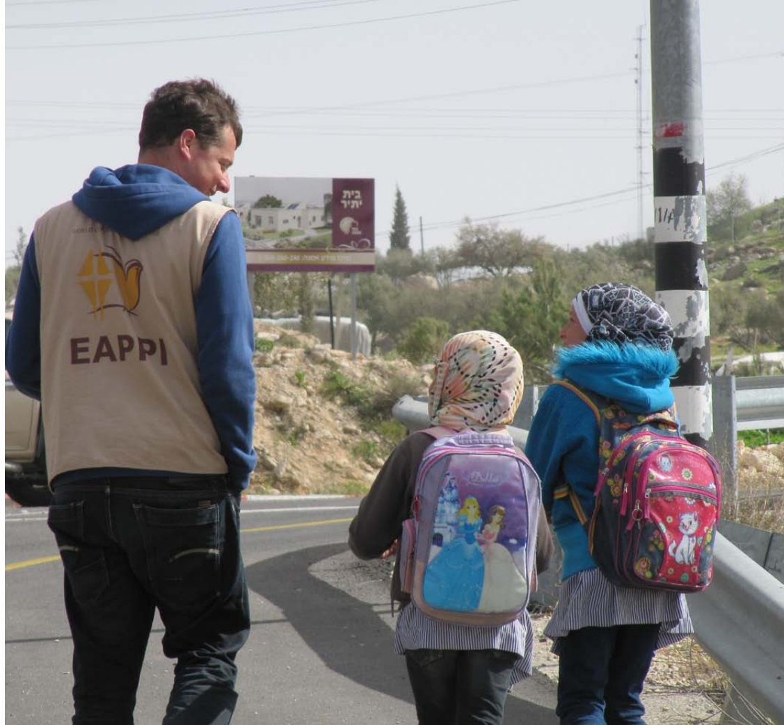
An EA accompanying schoolchildren from A Seefer, in the Seam Zone to their school in Imneizil in the South Hebron Hills.

At these locations, EAs accompany children on their commutes to and from school, display a visible presence at a number of West Bank / East Jerusalem checkpoints and schools; document data and cases of harassment to share with concerned organizations for advocacy and intervention purposes; intervene when necessary to prevent and/or deescalate harassment in order to facilitate better access to education.