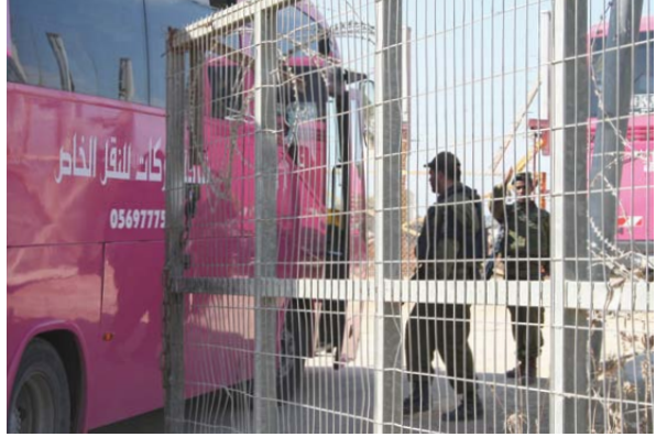
Israeli Soldiers board a school bus at the Habla Gate near Qalqilya.

They may also call an older student to exit the bus for an unsupervised body search in a small room at the checkpoint, while the rest of the students wait. In the past, there have been reports of incidents where male soldiers have conducted body searches on adolescent female students, and as a result, families have begun pulling their girls out of school upon reaching their teenage years to avoid this from happening to them.