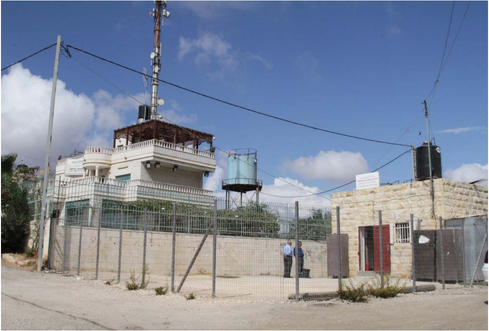
A recently built settlement housing unit behind the one-room Nabi Samwil School.