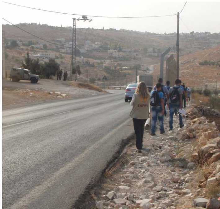
An EA walks with a group of students to their school along the edge of a bypass road in Tuqu' that is frequently used by Israeli settlers and soldiers.