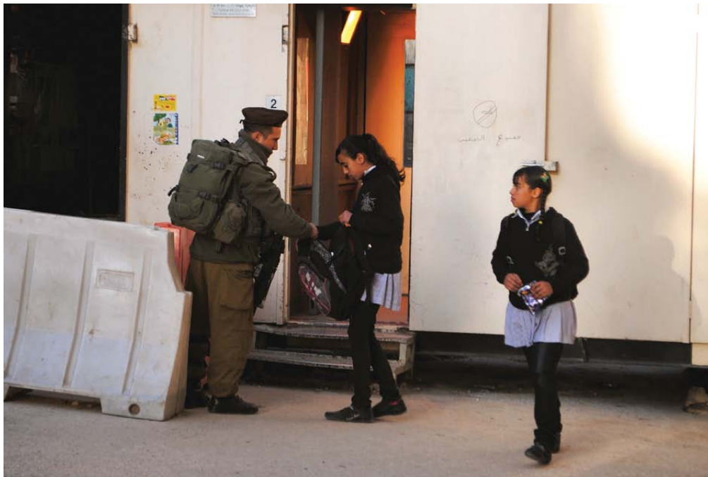
An Israeli soldier checks students bags as they pass through Military Checkpoint 56 on their way to the Cordoba School in Hebron.