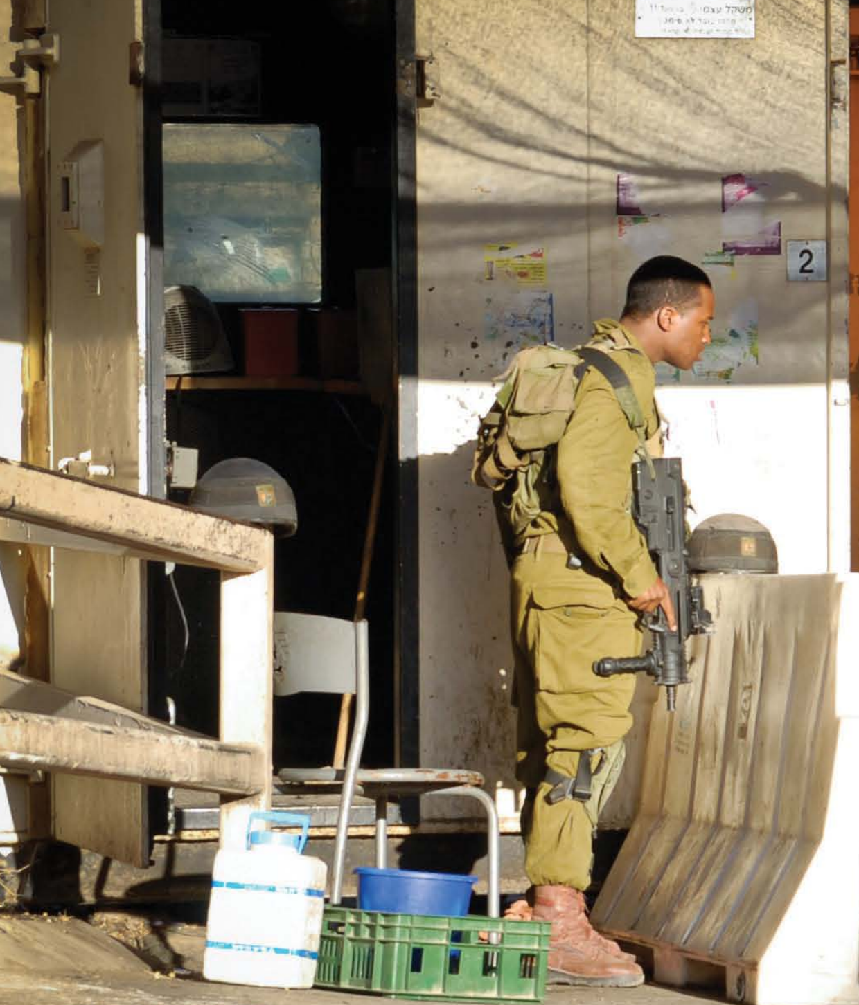
School children in Hebron passing through Military Checkpoint 56 on their commute home from the Cordoba School.