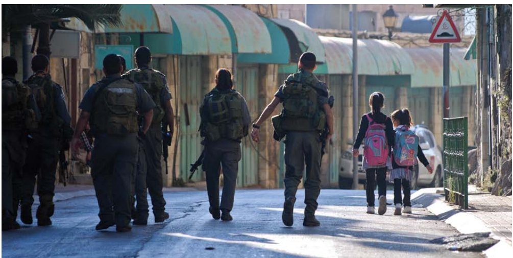
Two girls from the Cordoba School in Hebron walk past members of the Israeli Border Police on their commute to school.