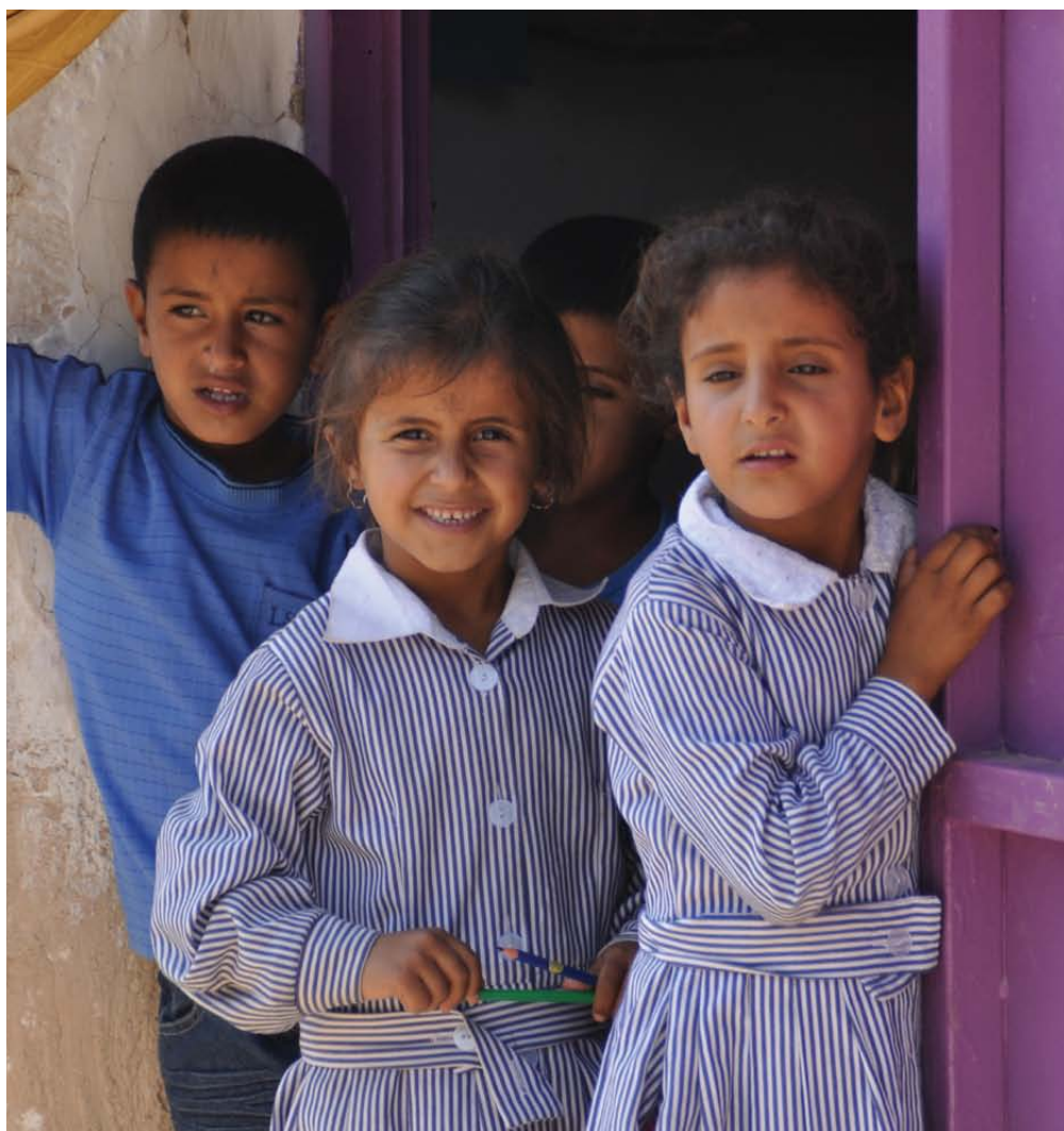
Curious students of the Tire School in Khan Al Ahmar.

The Jahalin Bedouins are originally from Tel Arad in the Negev Desert. In 1951 they were forcibly evicted from their ancestral lands and made refugees for refusing to serve in the Israeli Military. They found refuge in the hills northeast of Jerusalem and registered as refugees with 'UN Relief and Works Agency for Palestine Refugees in the Near East' (UNRWA). The Jahalin chose to live in this area due to the year-round surface waters of Wadi Qelt, vast grazing fields, and close proximity to Jerusalem's livestock market. However, due to settlement expansion, their access to grazing fields and water (and subsequently their main source of livelihood) has been increasingly reduced. Moreover, like all West Bank Palestinians, the Jahalin Bedouins have had restricted access to East Jerusalem and its livestock market since the establishment of the Barrier in 2000.