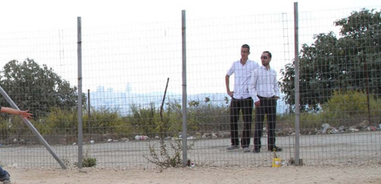
Israeli settlers look into the schoolyard of the Nabi Samwil School.

Thus, due to the lack of space and teachers, the school is only able to teach 25 first through third grade students. Students in grades 4-12 must travel through the checkpoint each day to the closest school in a neighbouring village, which is in-sight from the village, but takes an 8-kilometer trip to get there due to a detour around the barrier.