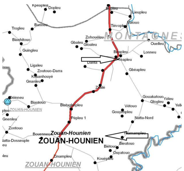
Teapleu and Zouan Hounien: Assessed Localities of Return

In this context, UNHCR recently organized an assessment visit to ten localities of return in Teapleu and Zouan Hounien. A report of the visit confirmed that minimum security conditions for return of IDPs in the assessed communities appear to have been met. While new IDPs are arriving on sites in Guiglo and Duékoué for registration, an unconfirmed number of other IDPs are said to have returned to 10 localities in the Zouan Hounien zone.