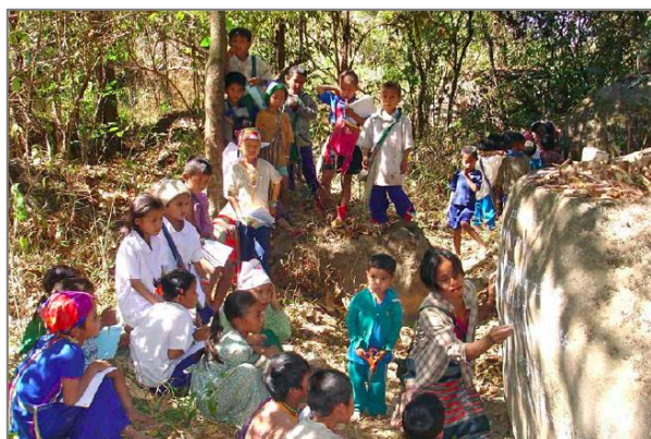
A bush school in Karen State, Burma/Myanmar.

In situations where other actors provided education, ANSAs claimed to do their best to support their activities. Some ANSAs said that they cover expenses of some schools and assist students to attend classes. This includes the provision of clothing, food, and sometimes even financial aids. They also claimed that they would encourage parents to continue sending their children to school. When schools were destroyed, they would contribute to their rehabilitation.