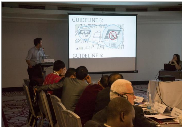
An expert from GCPEA presenting the Guidelines at Geneva Call's meeting, November 2016.

With respect to the Safe School Process, Geneva Call has been involved since 2014 in the drafting and promotion of the Guidelines for Protecting Schools and Universities from Military Use during Armed Conflict (the Guidelines). 13 Even before states were given the opportunity to endorse the Guidelines by adopting the Safe School Declaration in May 2015, Geneva Call had started their dissemination amongst ANSAs. In addition, the Guidelines were presented for the first time to 35 ANSAs at the Third Meeting of Signatories of the Deed of Commitment in November 2014. 14