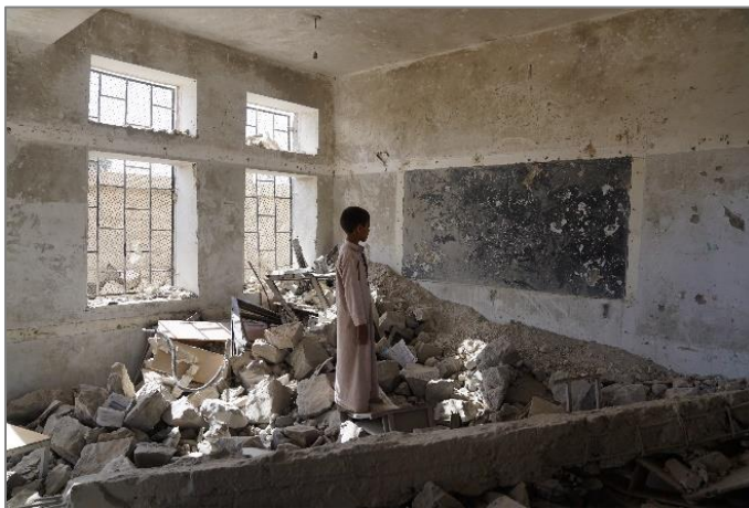
A student from the Aal Okab school stands amid the ruins of his classroom, destroyed during the conflict, Saada, Yemen.

Most ANSAs reported that there have been attacks on schools in their areas of control. One ANSA specified that although attacks had not been directed at the schools, these had been affected by indiscriminate attacks. Others ANSAs mentioned both targeted and indiscriminate attacks on schools, looting, killing of students, damaging and destruction of schools, gathering of intelligence in schools. The means of attacking schools were heavy artillery, aerial bombardments and intentional rifle fire. One ANSA also considered that the seizure of a school by enemy forces was an attack, as well as sending people to investigate into the schools and gathering intelligence from teachers and administrators of schools by forcing them to file regular reports.