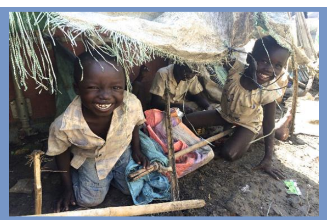
IDP children playing at UNMISS PoC site in Malakal, March 2014

"We have already forgotten what we learned in school because it has been so long. We are ready to go back." (Schoolboy, aged 12)