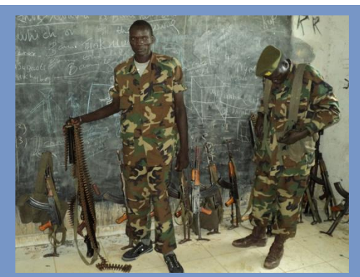
Soldiers occupying a school in Pibor County, Jonglei State, May 2013.