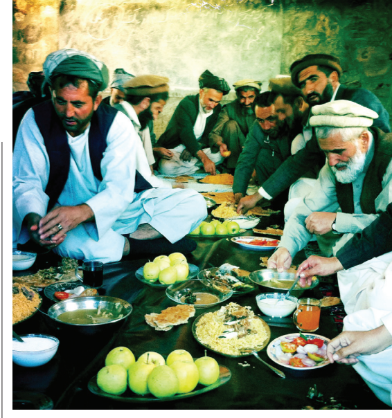
Village elders lunch at a community based school for boys, Tarusht, Takhar Province, Afghanistan