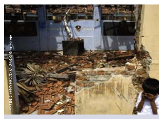
A boy covers his face after returning to his damaged school in Batticaloa District, Eastern Province, Sri Lanka, in 2007. The school was evacuated when the Sri Lankan Government and the Liberation Tigers of Tamil Eelam (LTTE) forces, a separatist guerrilla group, exchanged fire in the area.

Where incidents occur, schools may be closed in tens or hundreds for anything