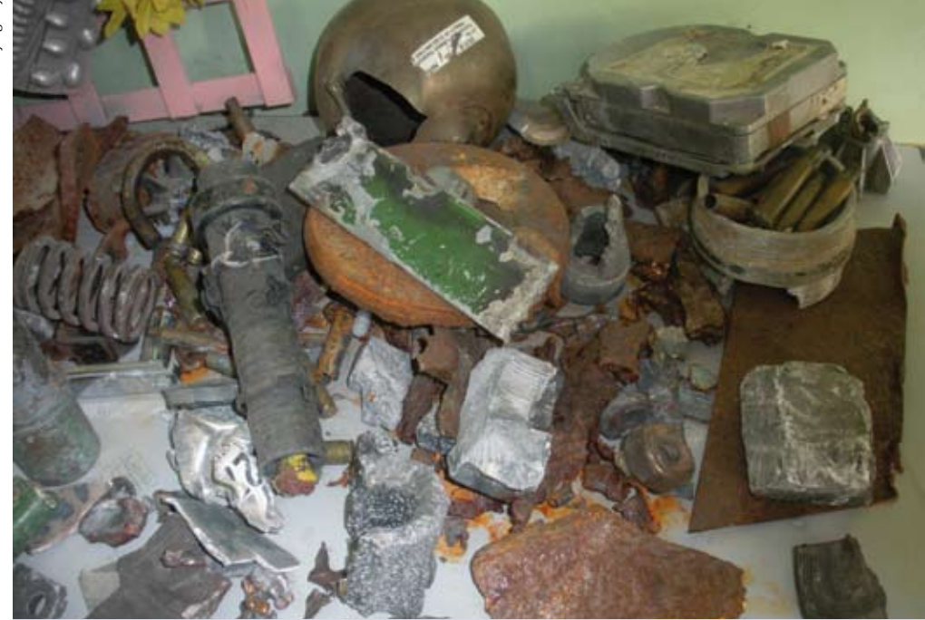
The headmaster of Shegaia boys' secondary school, located in the 'buffer zone' of Gaza, near the Israeli border, found all these weapons over the years. The school has been damaged numerous times and hit by Israeli shells on four occasions since it opened in 2003.