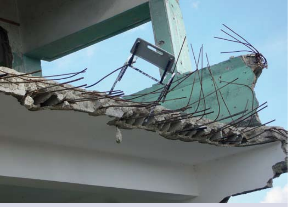
A chair dangles precariously in a bomb-damaged school in Gaza following Operation Cast Lead, 2009.

the measures that have been taken to increase protection for students and education personnel and to reduce impunity for perpetrators.