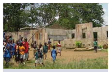
Koindu's primary school was completely destroyed during Sierra Leone's 11-year civil war. Rebel soldiers used it as a base and training ground - and they used its books and wooden furnishings as fuel for fires. Virtually nothing was left after the war but shells of roofless buildings.

The occupation of school and university buildings by armed groups or security forces, or their use as a military base, constitutes an attack on education