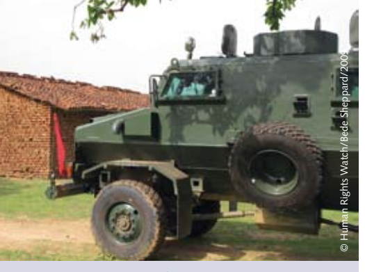
When security forces arrived to camp at Dwarika Middle School, India, on June 7, 2009, they turned up in an armoured troop carrier.

killed remained constant, at 28 in both 2007 and 2008. ^{\rm 19}