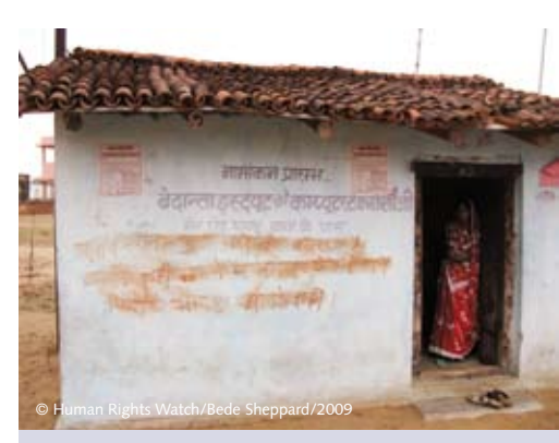
On the same night as the Naxalite attack on Belhara High School in India on 9 April 2009, red graffiti appeared on the walls of nearby buildings urging local residents to boycott the upcoming election. The graffiti here has been made illegible.

of power will frequently articulate that the purpose is to maintain the status quo, to have people develop the skills necessary to maintain the existing structure without threatening it.