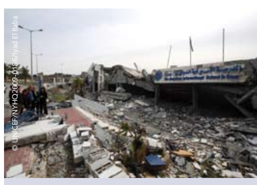
The American International School in the city of Beit Lahia in northern Gaza, the destroyed Palestinian territory, was completely destroyed during Operation Cast Lead. More than 170 schools in Gaza were damaged or destroyed during the hostilities.

A reported 250 students and 15 teachers were killed and hundreds more were injured in military strikes. Some students were injured by shattered glass while taking examinations; others were killed while waiting for the bus home