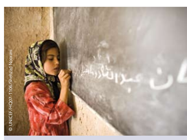
A girl writes on the blackboard inside a mosque that serves as a community-based school in Kamar Kalagh, a village on the outskirts of Herat, Afghanistan. As there are no official schools nearby, some 460 girls and boys from nearby villages attend informal classes here, although attendance, particularly for girls, is irregular.

from a choice of community-based and non-community-based measures, 72 per cent cited the establishment of security shuras in schools; and 56 per cent believed in general disarmament, 43 per cent in negotiation with the armed opposition and 36 per cent in increasing the police's involvement in protection of schools; only one per cent saw a role for international military forces.<sup>236</sup>