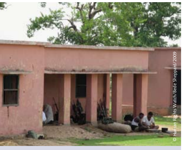
Security forces line their weapons against the school wall at Dwarika Middle School, India, on June 7, 2009.

For instance, it includes the closure of schools or their takeover for military or security operations by state armed forces or armed police, or by rebel forces, occupying troops or any armed, military, ethnic, political, religious, criminal or sectarian group.